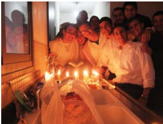
Photo Gallery Shabbat Chanukah in Meron